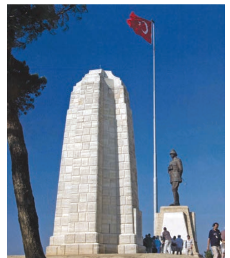
The Chunuk Bair memorial