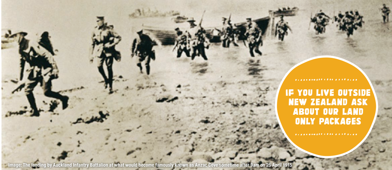
Image: The landing by Auckland Infantry Battalion at what would become famously known as Anzac Cove sometime after 9am on 25 April 1915

IF YOU LIVE OUTSIDE NEW ZEALAND ASK ABOUT OUR LAND ONLY PACKAGES