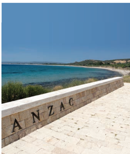
Above: Being in Gallipoli on Anzac Day is a touching experience not only for New Zealanders and Australians, but also the Turkish, as they too suffered great losses in 1915

As the Anzac Commemorative Site has a limited capacity, anticipated demand to attend represents a challenge to ensuring a secure, safe and comfortable visitor experience, while maintaining the dignity and solemnity of the centenary commemorations. Please refer 'Anzac 2015 –New Zealand Government advice on the Ballot Process' in the terms and conditions.